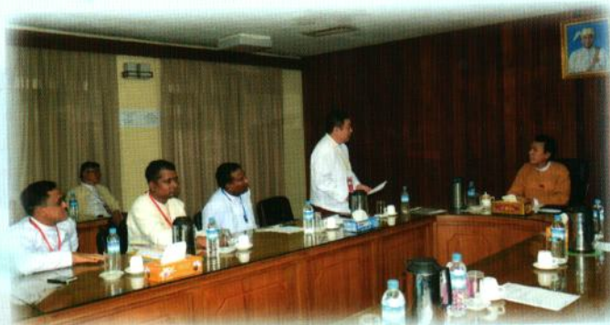
Meeting with Chief Minister of Yangon Region