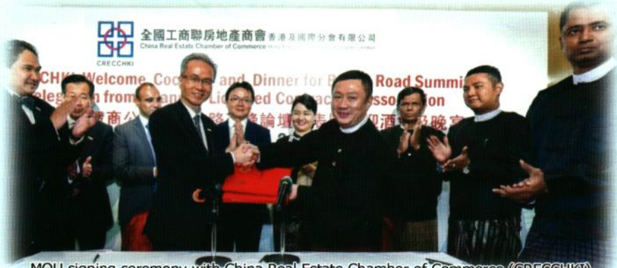
MOU signing ceremony with China Real Estate Chamber of Commerce (CRECCHKI)