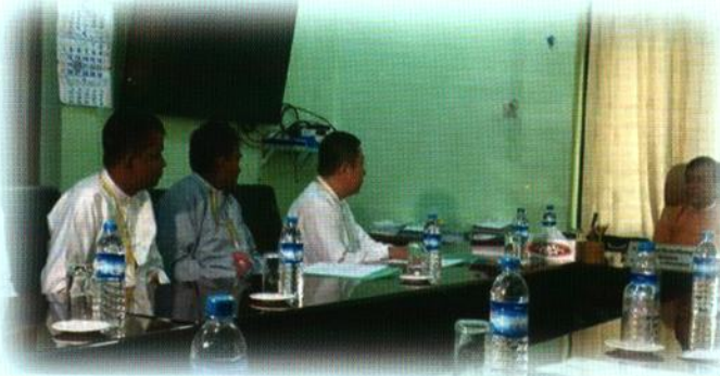
Meeting with Chief Minister of Mandalay Region