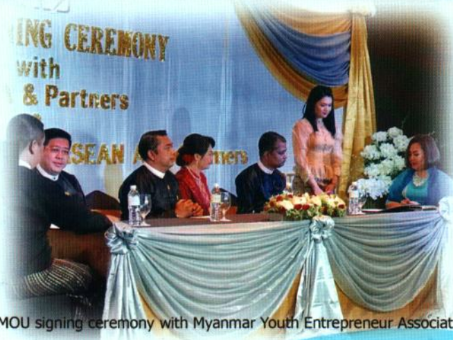
MOU signing ceremony with Myanmar Youth Entrepreneur Association.

No.420, 1 st Floor, Marchant Road(Near 45 th Street), Botahtaung Township, Yangon, Myanmar.