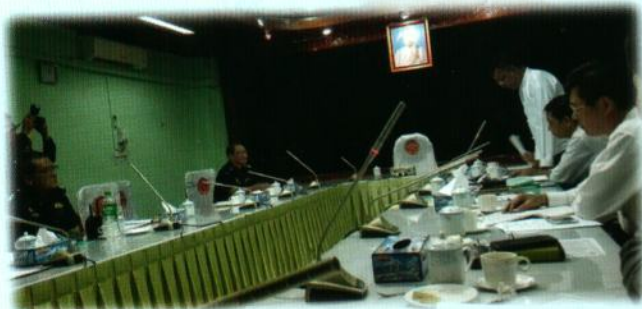
Meeting with responsible officials