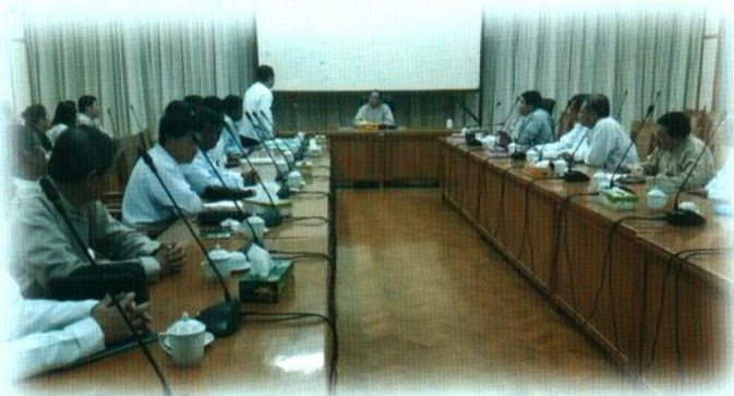
Meeting with Union Minister for Construction