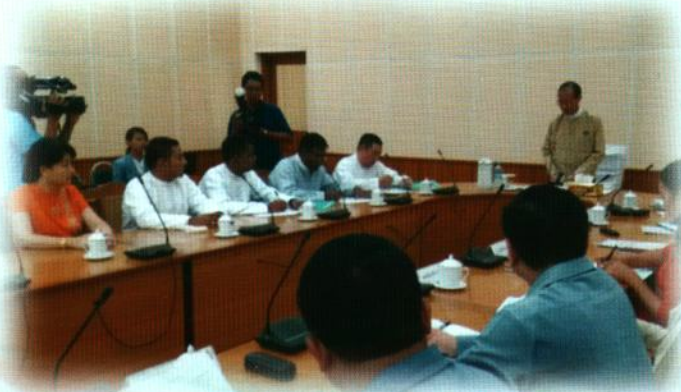
Meeting with Nay Pyi Taw Council Chairman